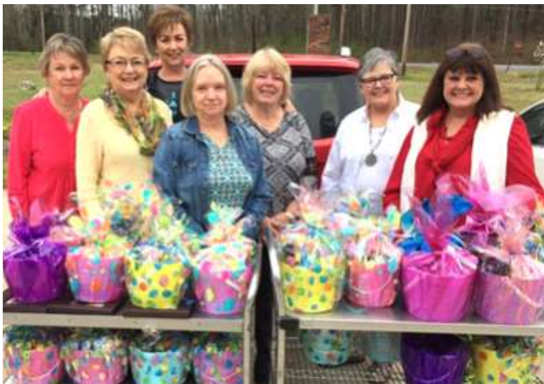
Twelve ladies from VBC got together again this year to make Easter baskets! These special baskets are going to residents (who don't get many visits) at Village Springs Nursing Home.